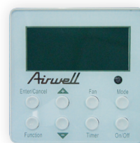
RCWE included with DAF